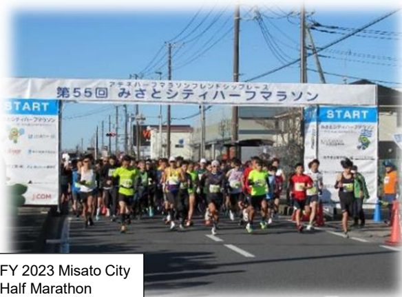
FY 2023 Misato City Half Marathon