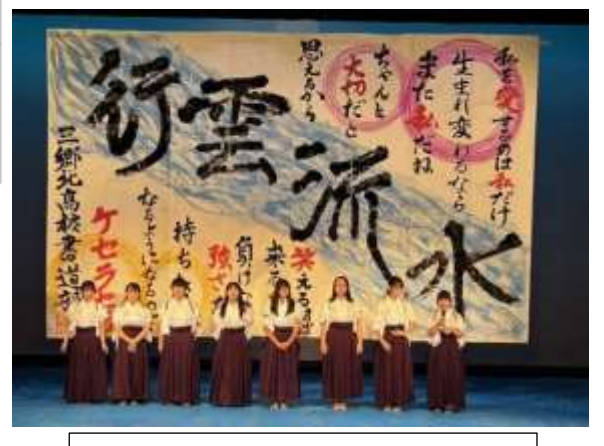
FY2023 Calligraphy performance by the students of Misatokita High School

<Inquiries>: Citizen's Exchange Section, Assistance for Citizens' Activity Division