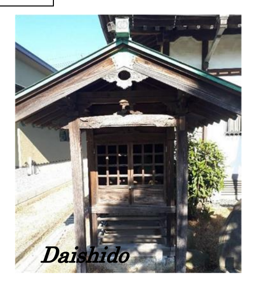
Daishido is on the left side of the main hall.