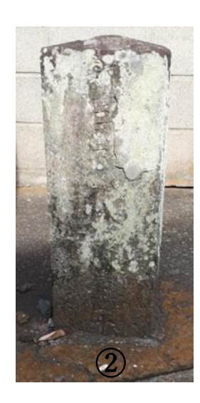
There are two stone pillars in the precincts.